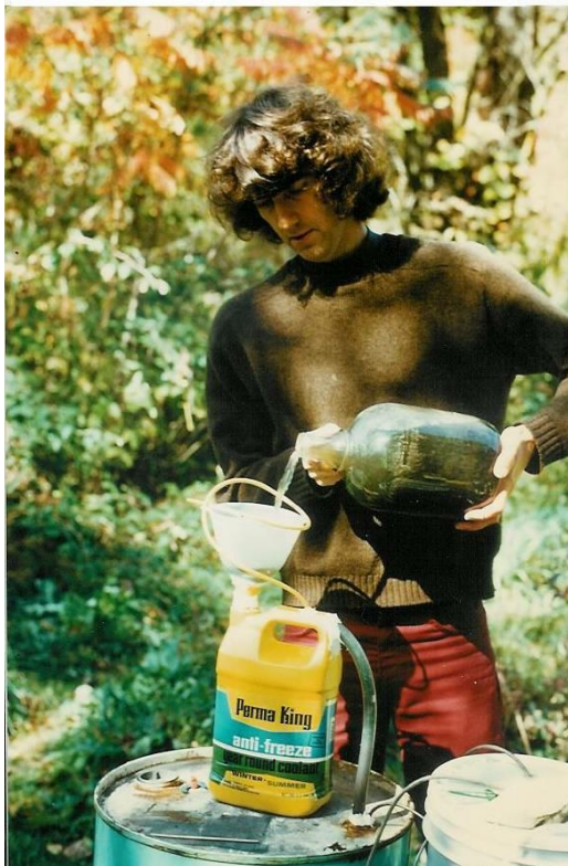
Microbial Tank Farm 2: Recycling effluent to Harvested Plant Material Degradation System